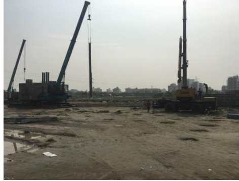
Pre Cast Pile Pictures