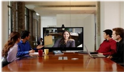
Meeting Room Solution

Technology Integration - Managed Service - On Demand Service- Conference Room Service - Maintenance Service - Distance Learning / Training - Web based Video Conferencing